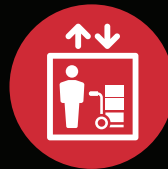
Goods & service lifts