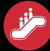
Escalators & moving walkways