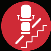
Stairlifts & homelifts