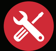
Refurbishment, service & repair

Stannah Connected Services www.stannahlifts.co.uk